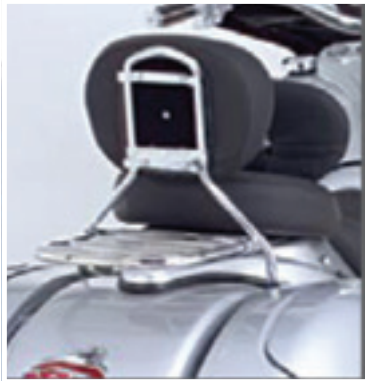
sissy bar/luggage rack