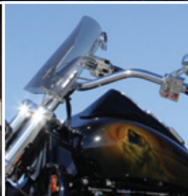
wind vest shield