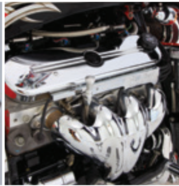
LS cam upgrade