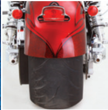
big tire kit